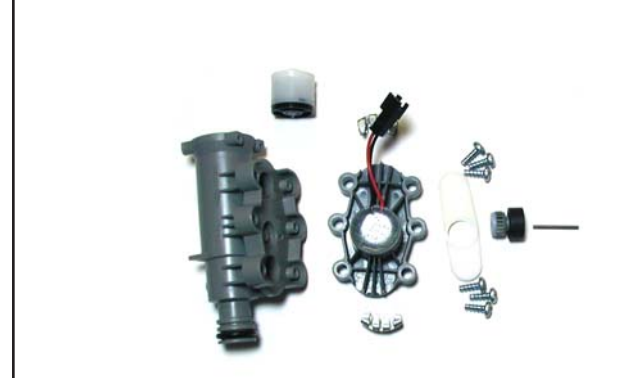
FIG. 4 HYDRO GENERATOR BREAKDOWN 586 AND ABOVE