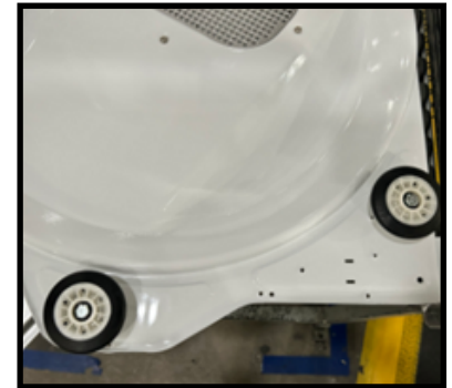
Rear Bulkhead Rollers

Step 3. Remove the lint or dust accumulation.