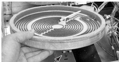
Spring Clip In Slot