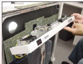
Replace fascia panel