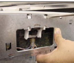
Bend tabs back