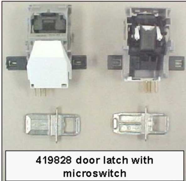
419828 door latch with microswitch