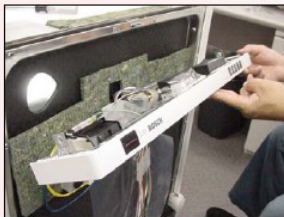
Lower fascia panel

NOTE: Door latches for UC/14 & up models are different than UC/06 - UC/12 models -- they cannot be interchanged. Must replace strike plate & door latch together.