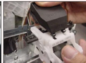
Replace cover (in slots)