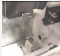
Tabs (inner view)