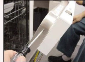
Remove panel screws

NOTE: Door latches for UC/14 & up models are different than UC/06 - UC/12 models -- they cannot be interchanged. Must replace strike plate & door latch together.