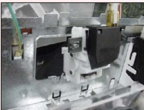
Remove door latch

HINT: Make sure plastic latch tabs are aligned & metal console tabs are bent back completely during reassembly.