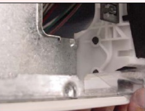
Insert latch into tabs